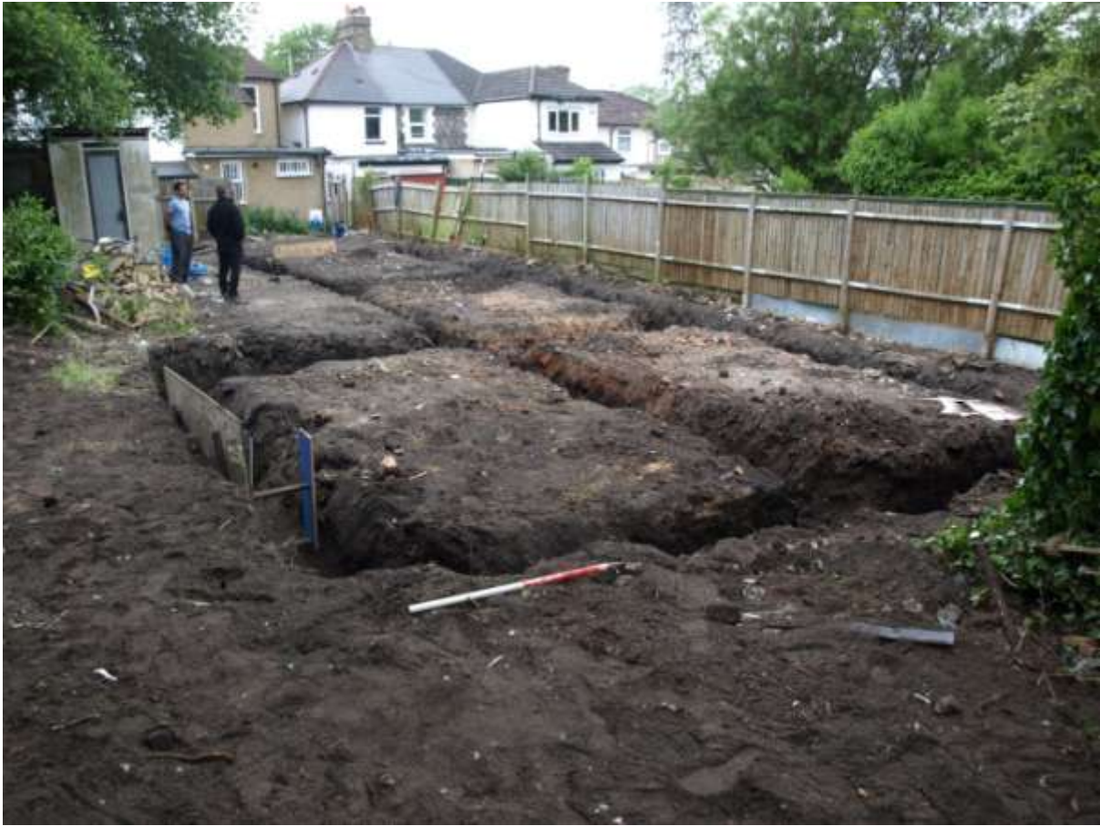
Plate 4. Completed foundation trenches (facing south-west)