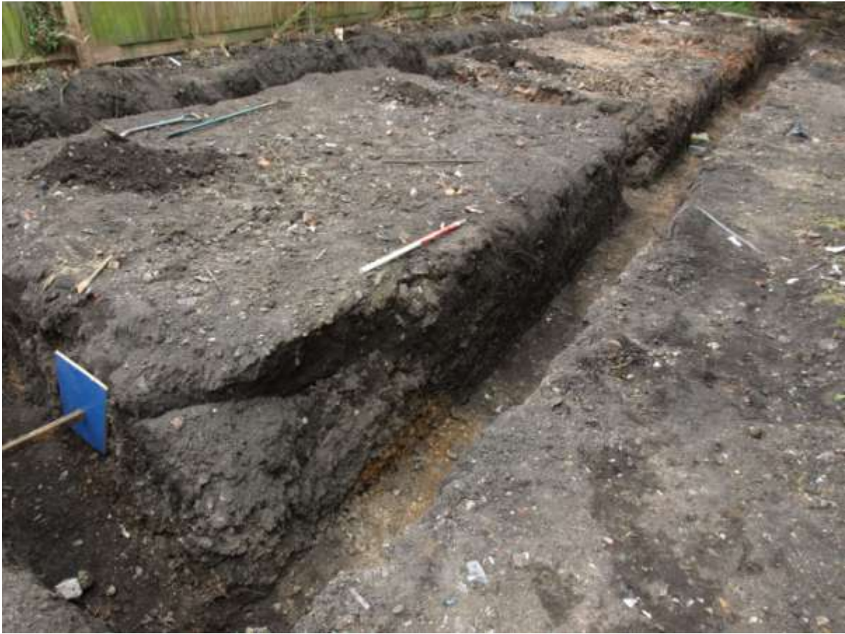
Plate 2. The site showing ground works (foundation trenches) with natural geology intermixed with subsoil (facing north-west)