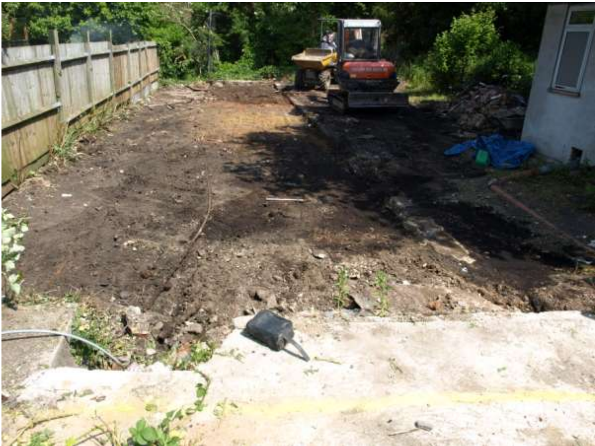
Plate 1. General view of site with the Archaeological Strip, Map and Record ongoing (facing north-east)