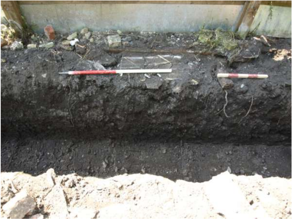
Plate 3. Foundation trench section (facing west)