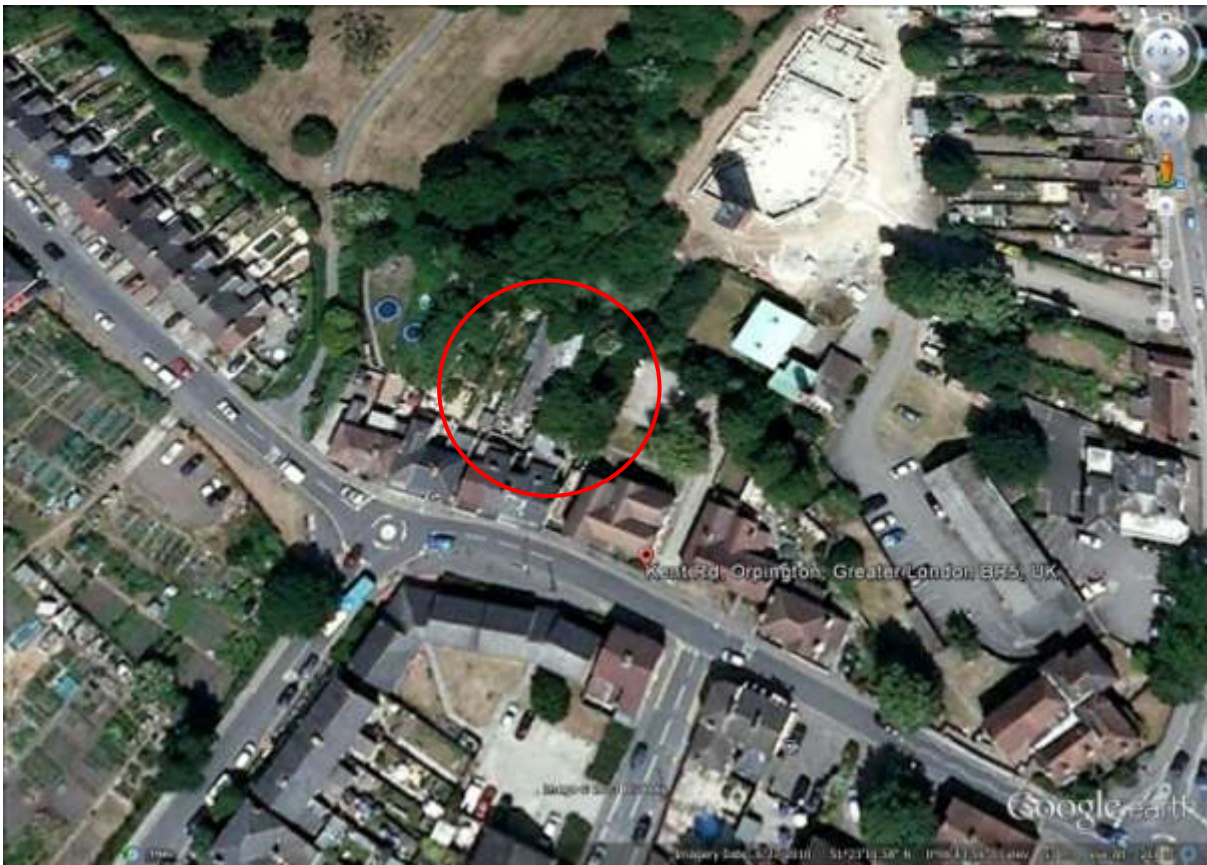
Plate 1. Aerial view of site (red circle) showing the site prior to development, eye height 214m.